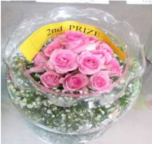
Second Prize for Flower Arrangement in Teacher's Day