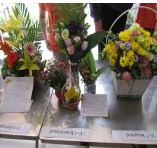
Flower Arrangement for Teacher's Day

An authentic commitment to student success lies at the core of our advancing explicit education model. Equipping our student learners with the best education possible and preparing learners for their future are shared goals by parents, teachers, and all SIS community members. Continuing to work in collaborate partnership, we will strategically guide all learners to succeed by assisting them to develop critical 21 st -century explicit learning skills that prepare them for success in school and after they graduate.