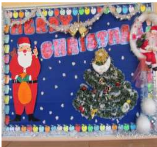
Decoration welcoming Christmas