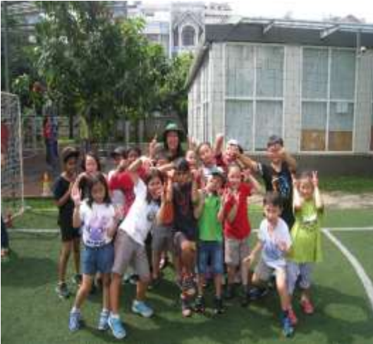
Year 3 International Students

Social media/online: Try using English for your online chats, writing on someone's wall or sending out a tweet. The language is short and informal just like speech. Switching your search engine to the English language version of msn, yahoo, Google etc. and only searching in English can be a good way of practicing fast reading for specific information in English.