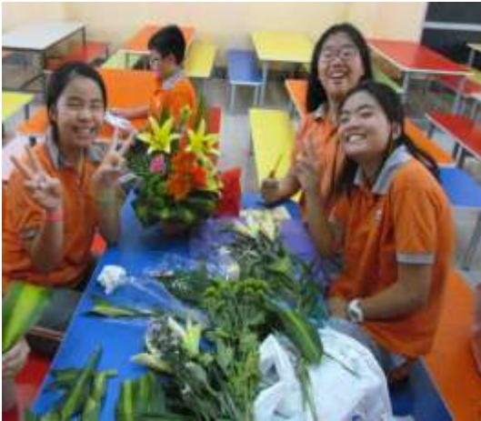
Students preparing for Flower Arrangement in Teacher's Day