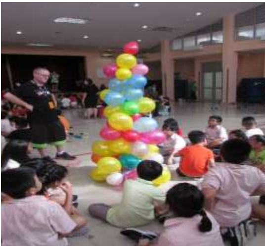
Activities for Teacher's Day