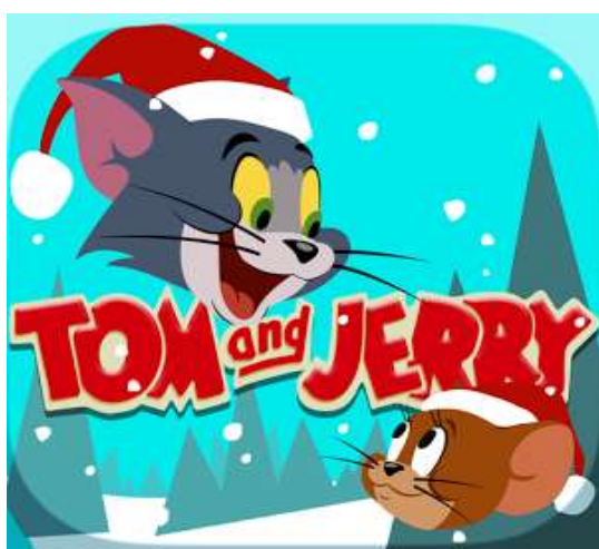
Showing "Tom and Jerry" for Kindergarten students in Movie Night