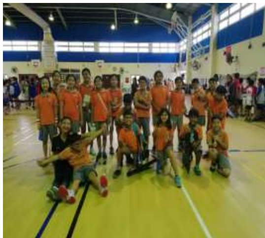
U11 Badminton Team