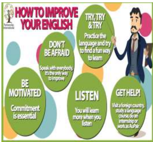
How to improve your English

In school year of 2017/18, IG 2 Chinese class has 9 students. In the chart below, it shows division about how students determine their aimed exam.