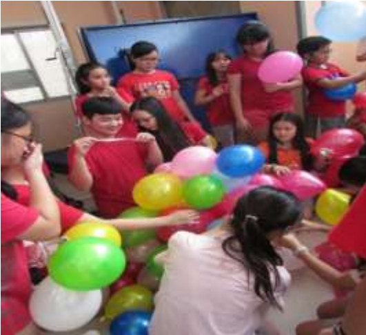
Activities for Teacher's Day