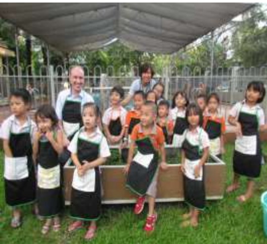
Planting trees activity for Kindergarten students