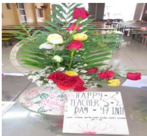
Year 7 Int'l got the 1 st place for Flower Arrangement in Teacher's Day