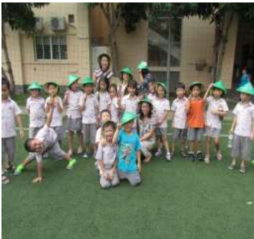
Year 2 Integrated Students