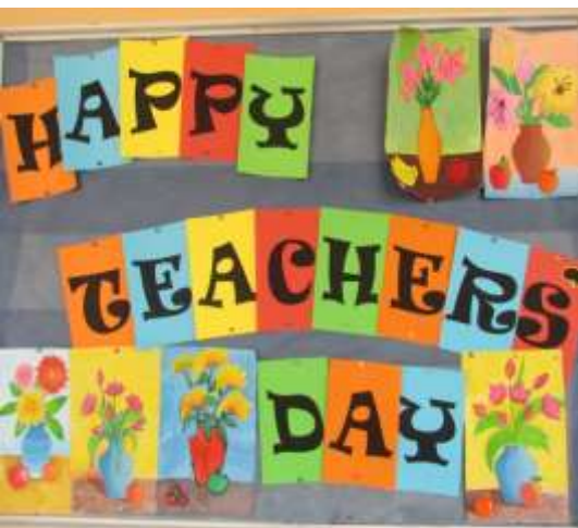
Decoration welcoming Teacher's Day