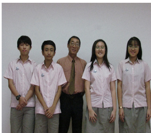
Students who won English contest of Binh Chanh DOET