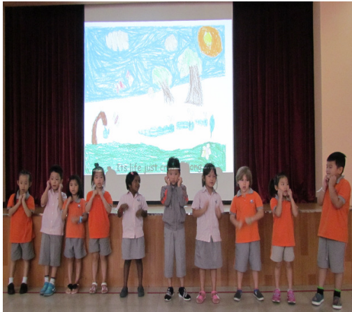
Year 1 International students in weekly Assembly