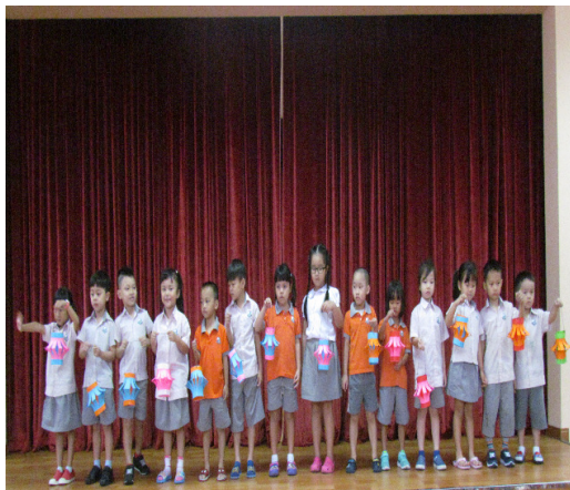
Students show lanterns in Mid-Autumn Festival