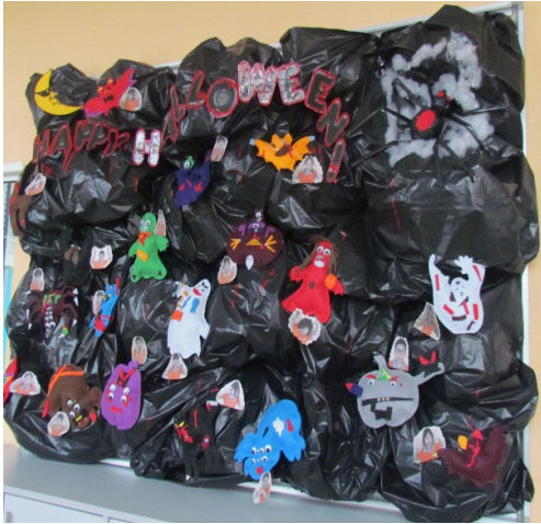
Door Decoration at Halloween