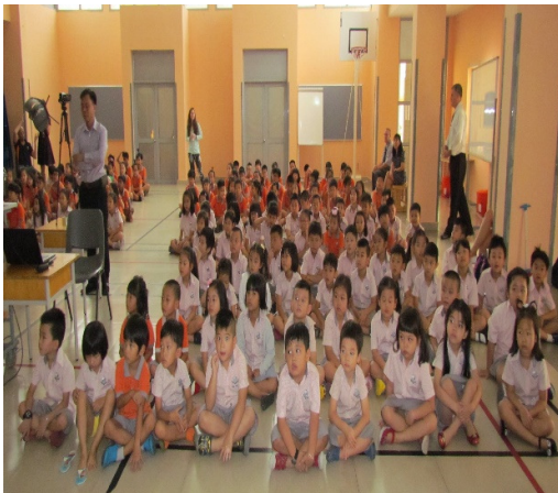
Junior Students in the Assembly