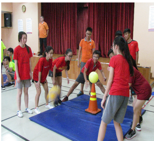
Students playing in Sport Day

We will be taking the stage in the Hall at 8:45 on Tuesday 14 th November. We hope to see you there!