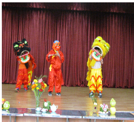
Lion Dance in Mid-Autumn Festival