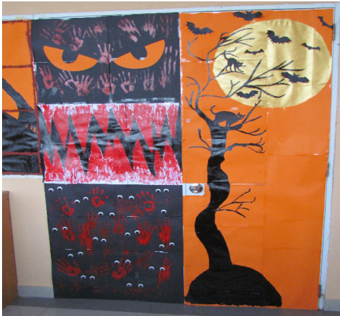
Door Decoration at Halloween