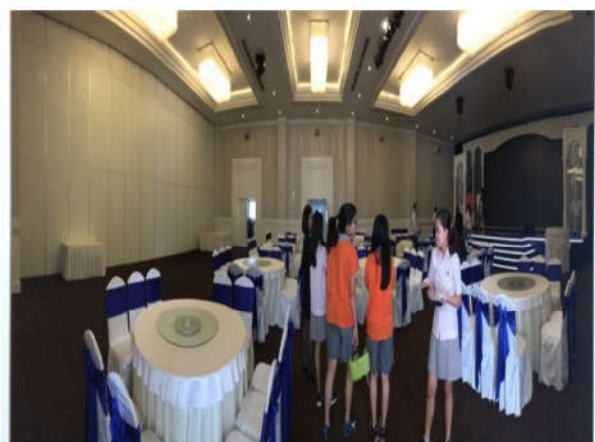
Senior High School students checking out the Crystal Palace Hotel in Phu My Hung.