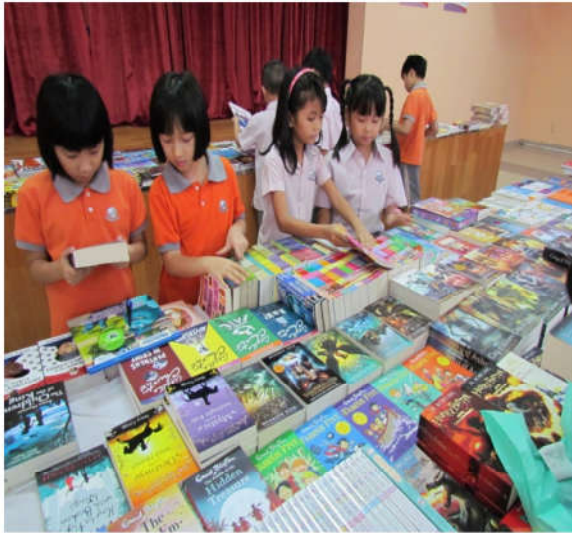
Book Fair 2016