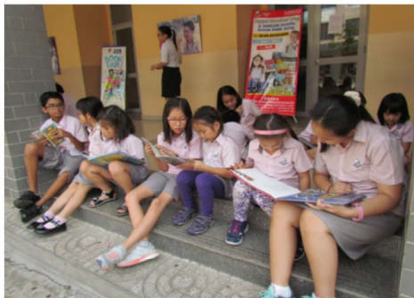
Students reading books