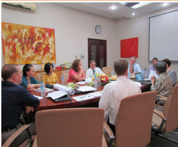
Management meeting with WASC

To be an educational institution of excellence from Kindergarten to University Foundation level combining Eastern Values with an International education to produce global citizens.