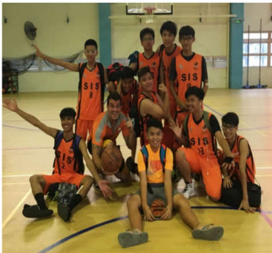
Basketball Team members – U19

Address: No. 29, Road No. 3, Trung Son Residential Area, Hamlet 4, Binh Hung Ward, Binh Chanh District, Ho Chi Minh City, Vietnam Tel: (84-8)5431 7477 Fax: (84-8)5431 7471 Email: enquiry@saigonsouth.sis.edu.vn