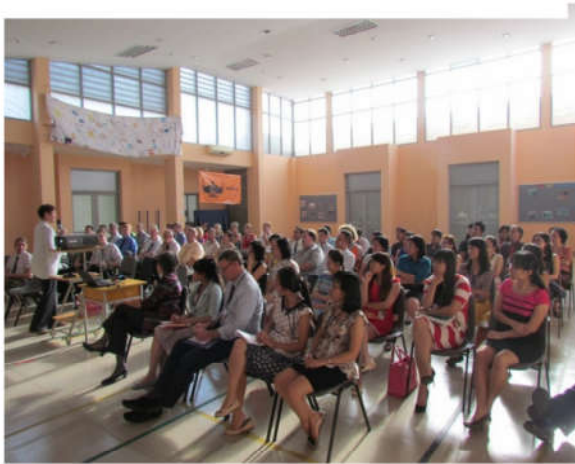
Staff meeting with WASC