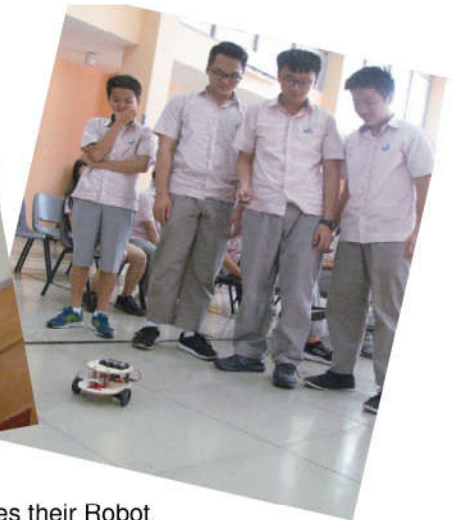
TinkRworks introduces their Robot