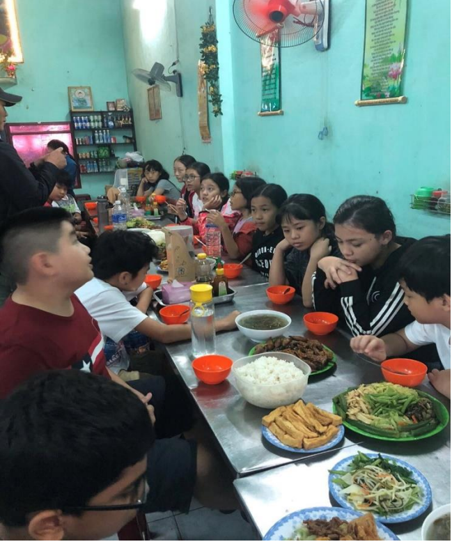
Year 6 Students participating in OBV course