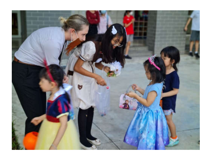
Halloween's activities "Trick or Treat"