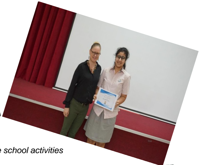
Students with the school activities