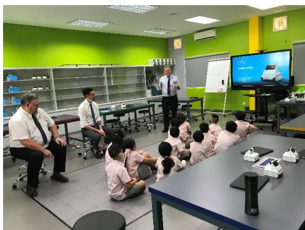
Year 3 International students during the STEM lesson