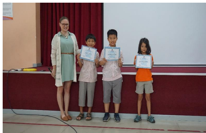
Giving certificates for students getting high score for the Dyned programme