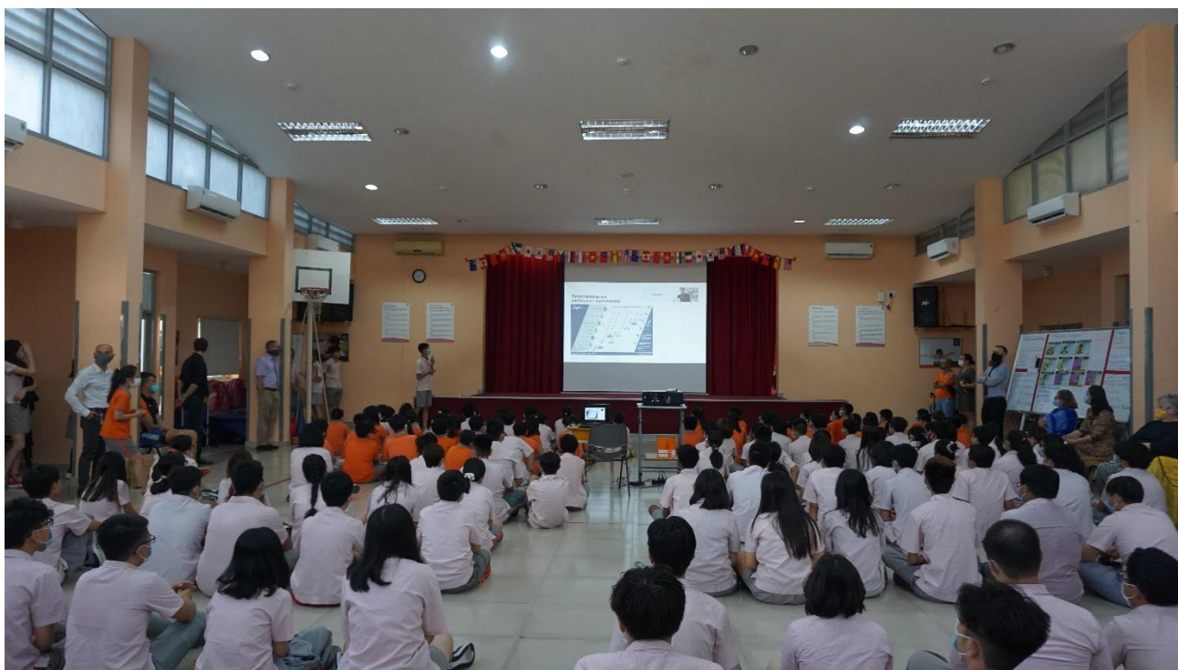
Presentation of Students during the weekly Assembly