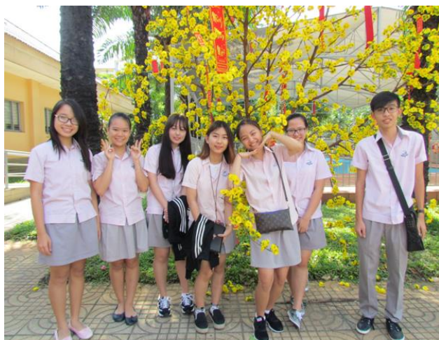
Participants in Business Competition in Danang (16 Jan 2016)