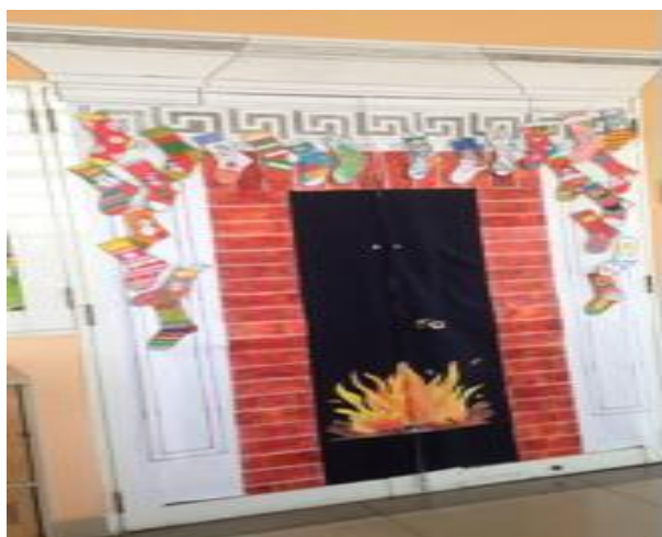
Door Decoration (Y4 Int'g)

A new year has just started and we have a lot to catch up on and events coming up. We would like to congratulate the following classes for winning the Christmas Door Decoration Competition: Prep Int'l (Kindy), Year 4 Int'g (Juniors) and IGCSE1 (Seniors). Currently, the Student Council, as well as many volunteers, are working on one of the most exciting upcoming events – Culture Festival. Culture Fest will be held on the 24 March. So get ready to learn more about and experience the different cultures that are represented by students in our school.