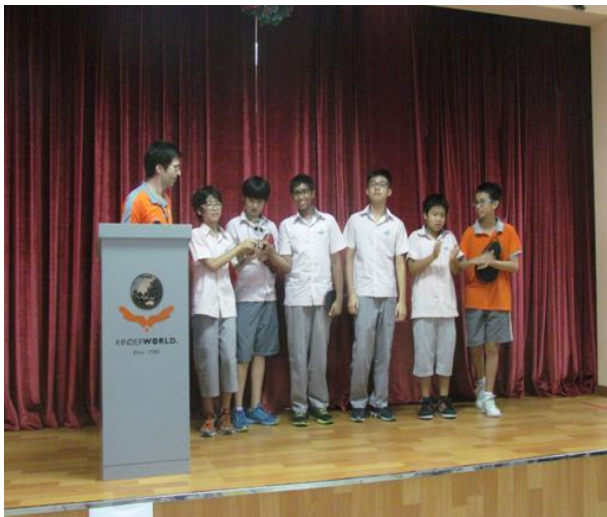
Team members – U14 Table Tennis