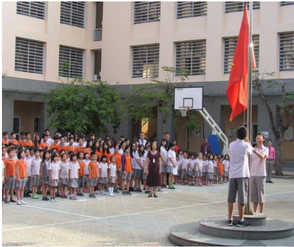
Flag Raising Ceremony (Every Monday)