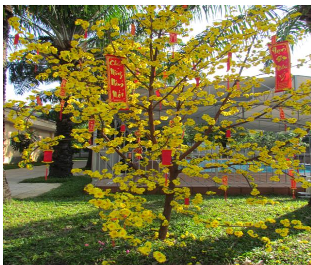
Happy New Year 2016