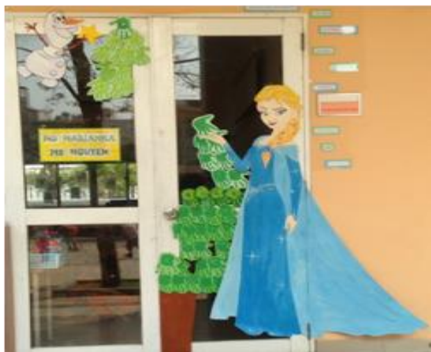
Door Decoration (Prep Int'l)

Participation in such activities shapes the students into active and responsible citizens.