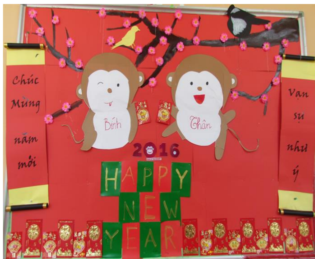
Decoration welcoming 2016 Lunar New Year