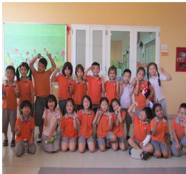
Year 1 - International