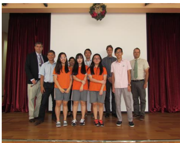
Business Competition – Team 2