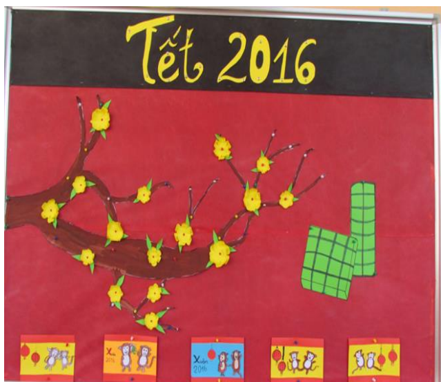
Decoration welcoming 2016 Lunar New Year