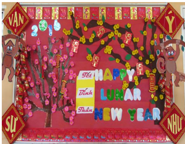
Decoration welcoming 2016 Lunar New Year