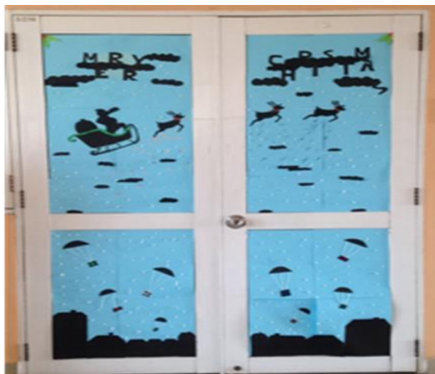
Door Decoration (IGCSE 1)