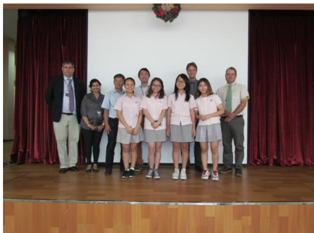
Business Competition – Team 1