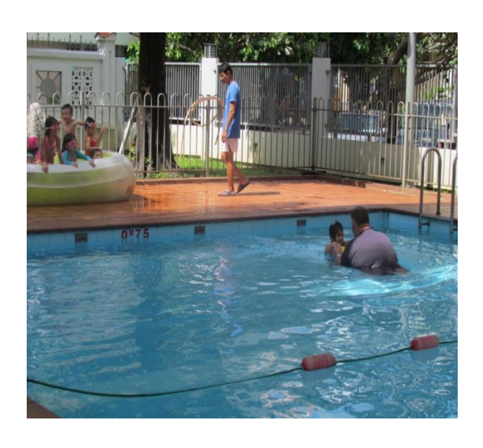
Learn to swim club