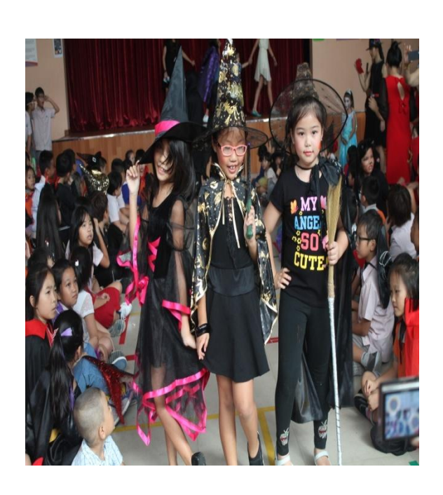
Halloween fashion show

The Volleyball program is a relatively new, starting just over two years ago, but the progress players have made since that time has been wonderful. The team has gone from a small group of girls to a large group of boys and girls involved. All the players have done tremendous work over the past two years and I am proud of each and every one of them. This year all of that hard work has paid off for the U19 Girls' team. On November 12, SSIS hosted the SISAC championship. Our girls played three grueling matches to end up facing SSIS in the finals. This was the first time in SIS history that one of our volleyball teams has made it to the final game, earning a second place finish. They played a good game and showed excellent sportsmanship throughout the entire season. I look forward to coaching the U19 Girls again next year as we aim to capture the 1<sup>st</sup> place trophy. Congratulations to all of the U19 Girls for their historic win for SIS!